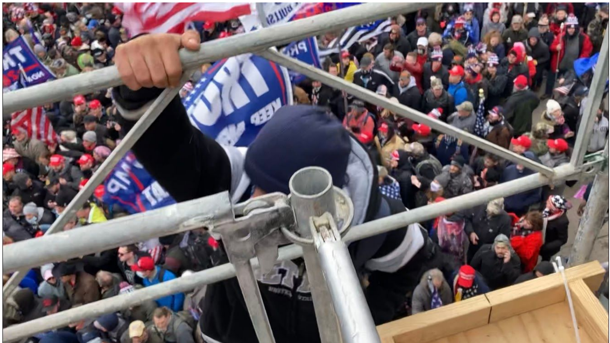
A man scales the northwest bleacher scaffolding outside the Capitol. 6 January, 2021

Similarly, the Capitol riot trended on Twitter as an ‘armed insurrection’. Yet there were only three arrests of people carrying firearms without a licence near the Capitol park area out of a crowd of tens of thousands. Perhaps this right-wing extremism, much like the left, is now far more pedestrian than we imagine.