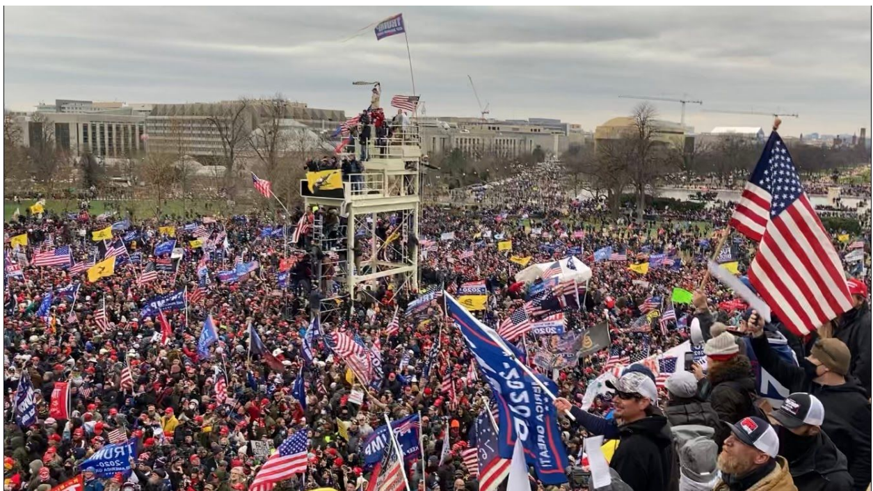
A westward view from the scaffolding. Washington D.C., 6 January 2021.