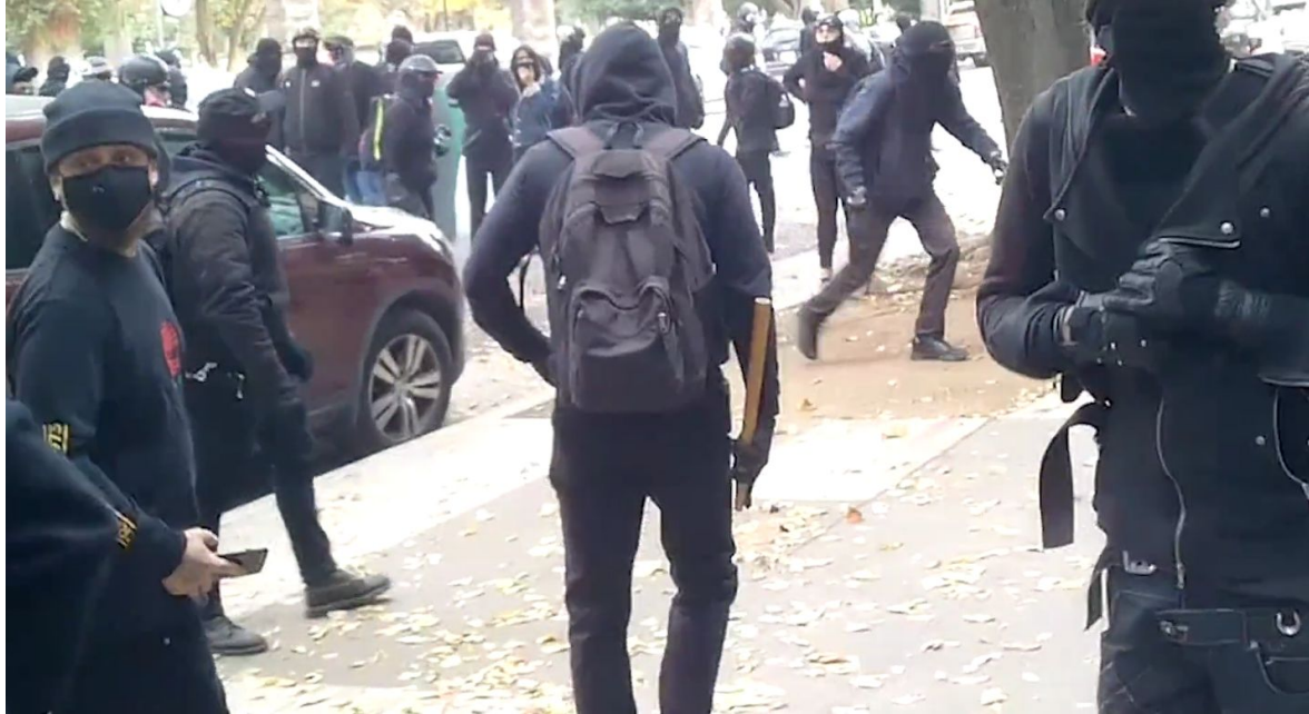
"They damn near killed them," shouts an observer as a Black Bloc rioter with a club walks away from the scene where a couple was beaten. Sacramento, California, 5 December , 2020