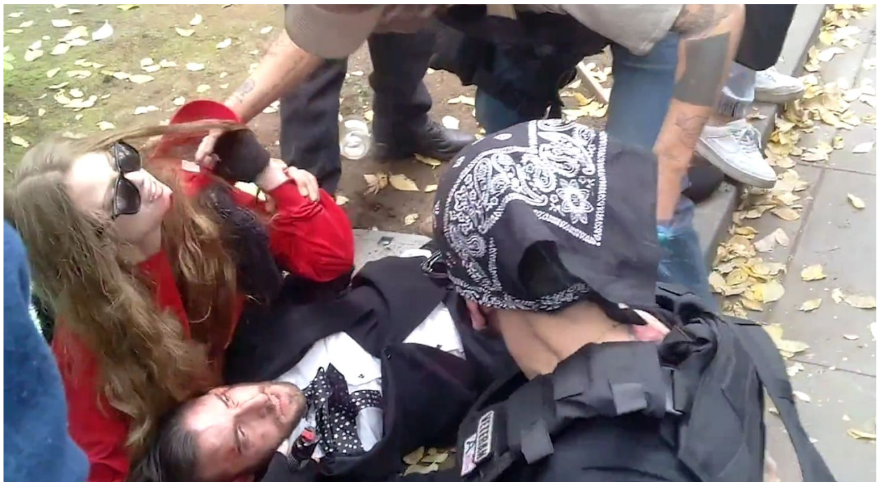
Antifa Sacramento led the attacks on those supporting a MAGA rally at the California Capitol. Antifa aligned medics then offered help, much to the confusion of the victims. 5 December 2020