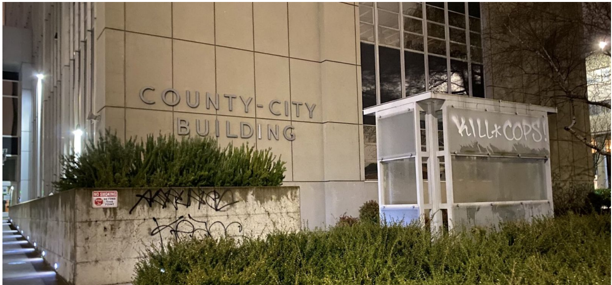
Tacoma, Washington 24 January, 2021

partisan political points. After all, just as violence begets violence, polarization & cultural complicity beget more of the same.