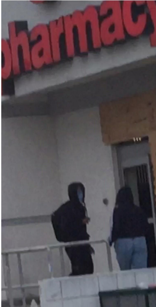
CVS Hollywood on Vine