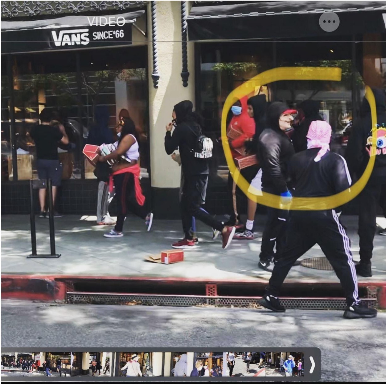
Red brimmed cap man in a latex mask, Vans Shoe Store, Santa Monica