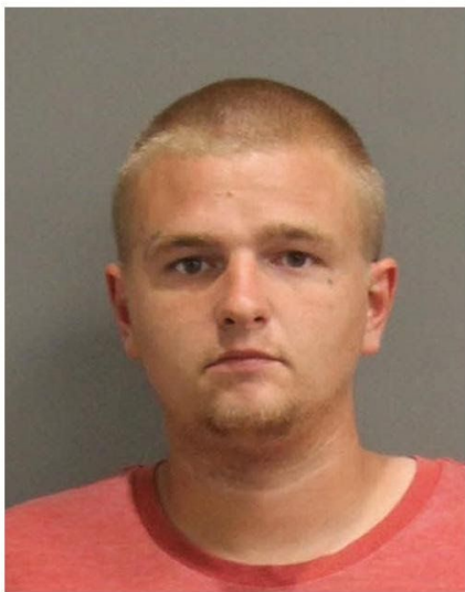
Somers Metro Nashville PD

If rooted purely in Self-identification, there's always the possibility of multiple entities at work, or individuals who have several affiliations joining the fray. Or none at all.