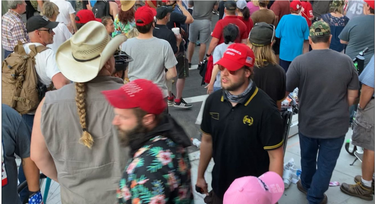
Roll out: One wears a Boogaloo shirt but not there for discourse on the 2nd amendment.