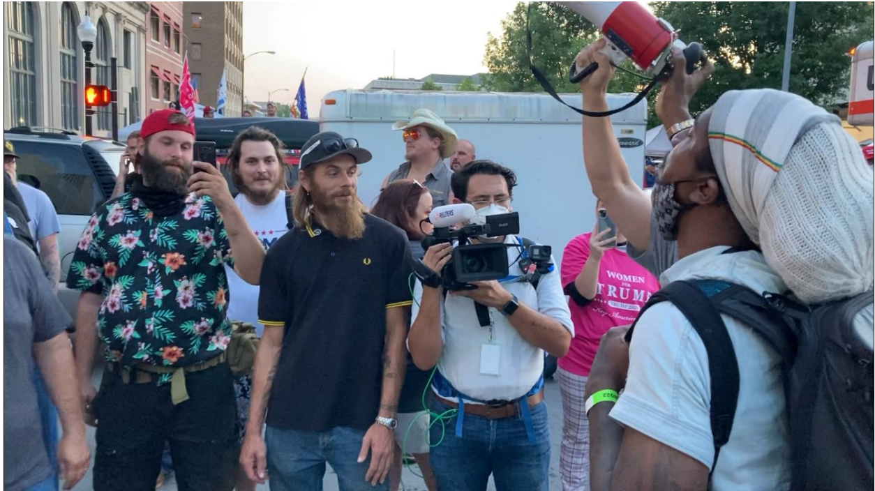
Bob Marley "Is This Love" is blasted into the megaphone.