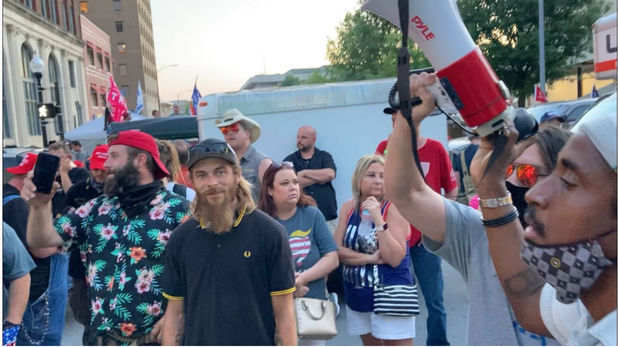
At least one Proud Boy was bobbin his head and kinda feelin it.