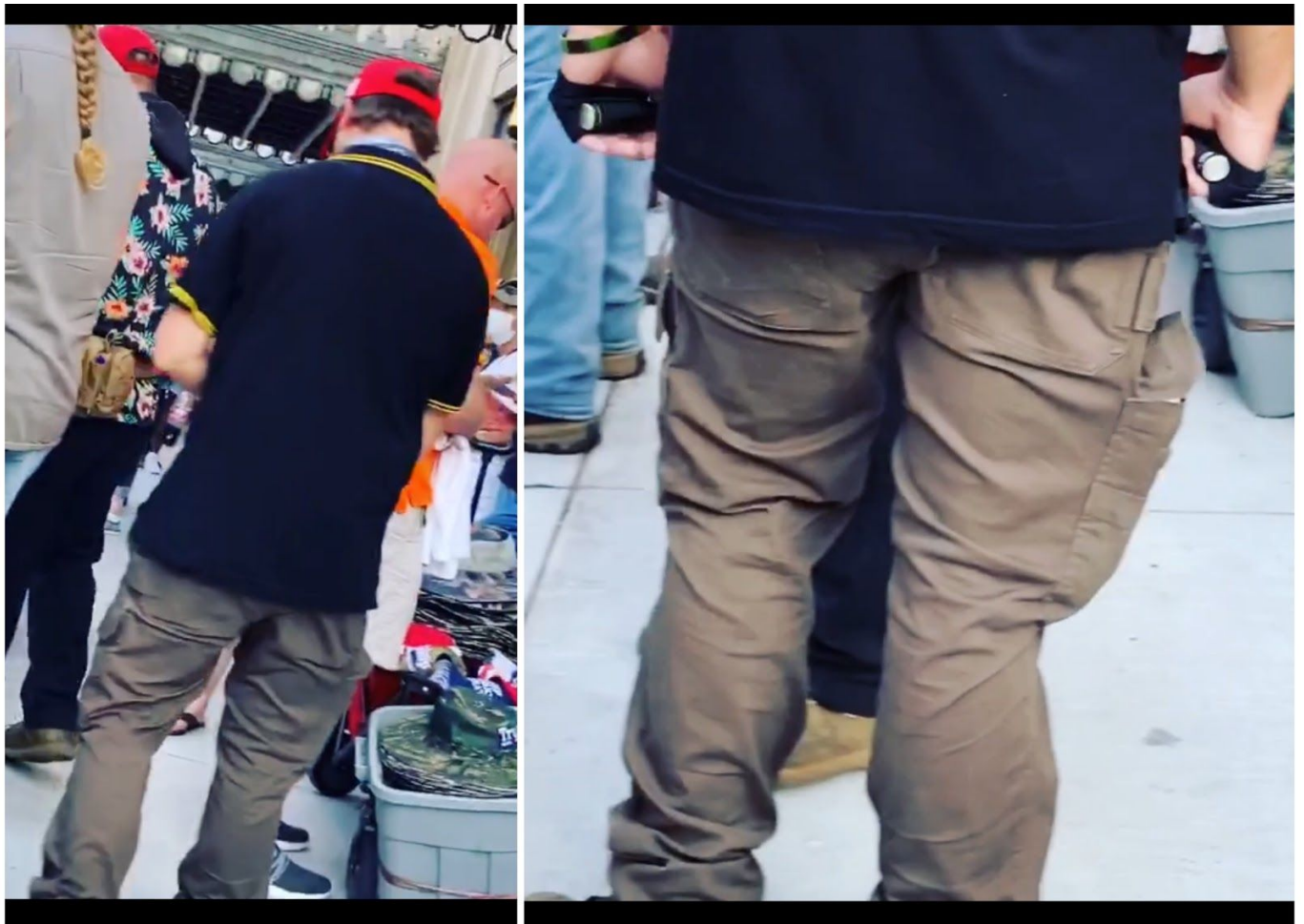
Proud boy in MAGA hat preps 2 canisters of no-good just as the BLM protest approaches.