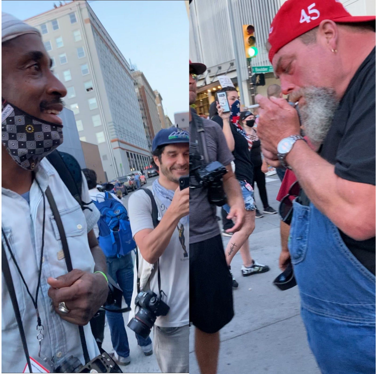
And this guy forgoes his cigarette to light up the proverbial peace pipe.