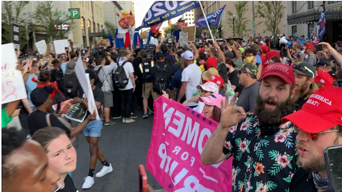
Flashing White Power signs on the front line at protesters appears more their thing.